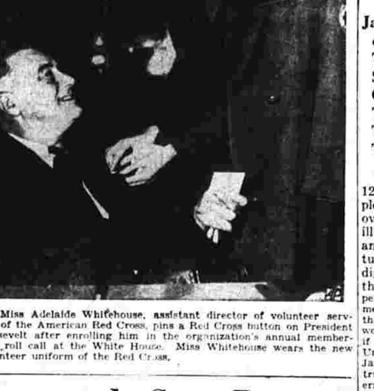
President Enrolled in Red Cross

President Roosevelt today enrolled in the Red Cross as a member of the organization's annual membership drive.